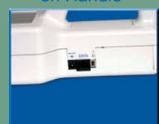
Easily Download Data to PC