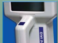
One-handed Operation with Start & Stop on Handle