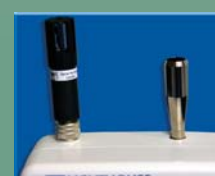
Removable Temp / RH and Isokinetic Probes