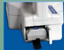
Removable Rechargeable Li-Ion Battery